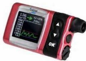
Insulin Pump Receiver