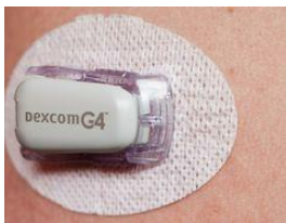
Transmitter & Sensor

CGM consists of a small sensor that sits under the skin and measures glucose levels in the fluid surrounding the cells (interstitial fluid), and transmitter (pictured below) which sends data to a receiver. The receiver used can be the display screen of a compatible insulin pump, a smart device or a Dexcom stand-alone receiver.